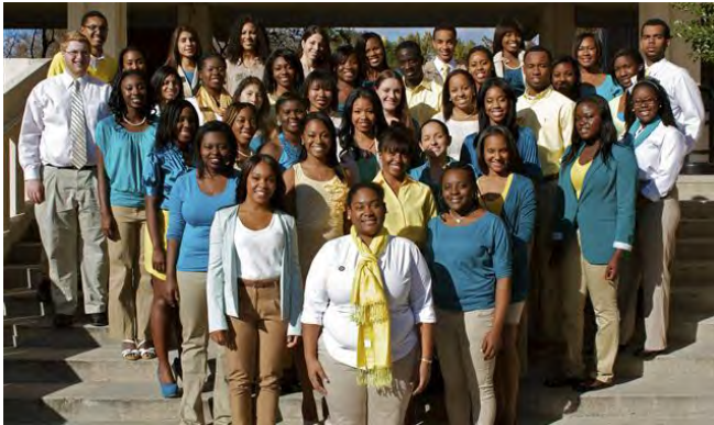
University of Florida * 2012 Black History Month Committee

Further information on each event can be found on the University of Florida/Black History Month Celebration’s website, www.ufblackhistorymonth.com .